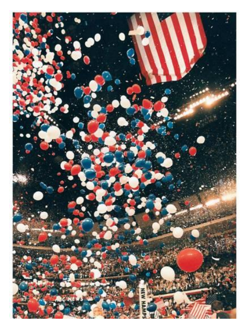
While defense and other important national priorities are being targeted for budget cuts in the coming years, more than $35 million in taxpayer dollars has already been allocated for next summer's political conventions.

Despite a federal budget crisis, taxpayers will be cutting checks this year to both political parties that could "help pay for the stages, confetti, balloons, food, and booze" for their political conventions.<sup>2</sup> The funds that are used to cover the conventions come from the Presidential Election Campaign Fund (PECF).