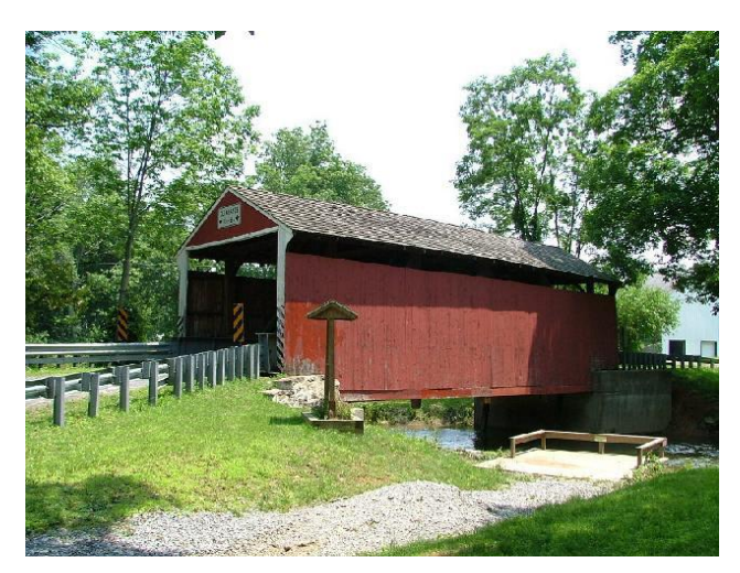
Rock Covered Bridge in Pennsylvania received $1.1 million in federal funds for renovations.

The bridge benefiting the most from the federal preservation funds in 2011 is the Rock Covered Bridge in Pennsylvania, which received $1.1 million in renovations. Rock Covered Bridge