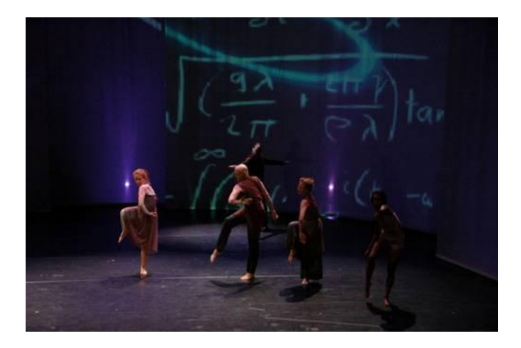
The National Science Foundation spent $300,000 for this dance performance to "facilitate dialogue" on the physics and the origins of the universe.

The New York Times panned both the cake and the discussion. While the dessert was "uninspiring," the "artificially induced conversation (at my table, anyway) was worse, studded with questions like, "So, origins, the origins of the universe — what do you know about that?"<sup>382</sup>