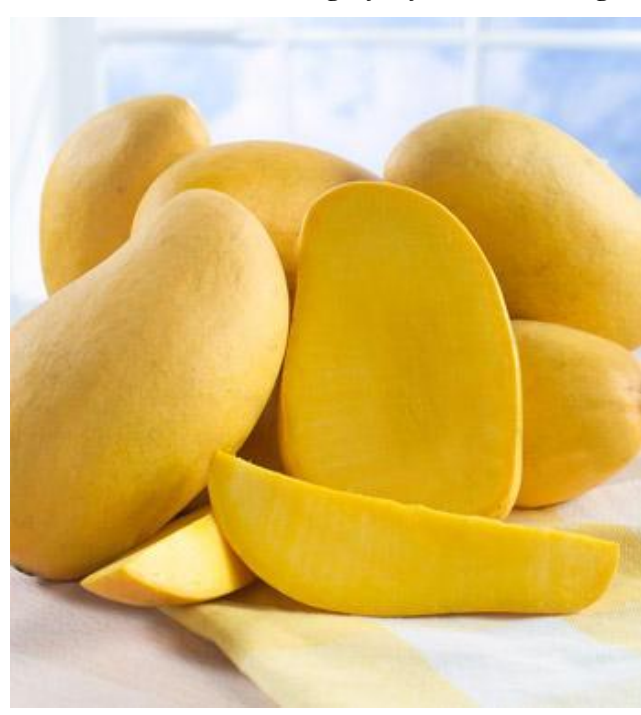
USAID's mango project in Pakistan turned out to be a lemon: millions were spent to help farmers, but instead put them at risk of defaulting on loans as a result of their participation in the program.

In four of five product areas USAID targeted – leather, livestock, textiles and dates – the agency abandoned its efforts roughly a year after it began them, with virtually nothing to show. For the