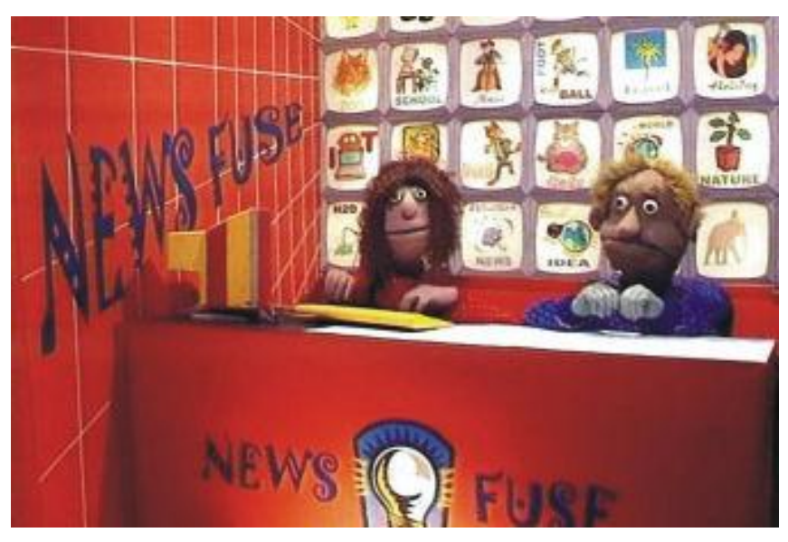
Puppets created by Rafi Peer Theater Workshop

According to news sources, the show will be renamed "SimSim Humara" and set in "a lively village in Pakistan with a roadside tea and snacks stall, known as a dhaba, some fancy houses with overhanging balconies along with simple dwellings, and residents hanging out on their verandas."<sup>75</sup>