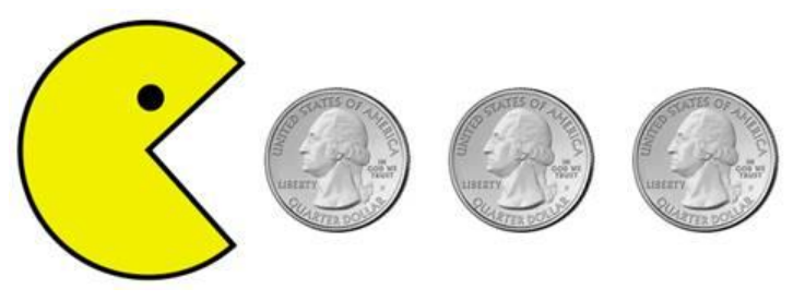
Over $113,000 is being gobbled up by Pac-Man and other video games as part of a survey of games at the International Center for the History of Electronic Games.

According to the grant notification, the $113,277 in federal funds will be used to "conduct a detailed conservation survey of approximately 6,900 of the 17,000 e-games in [the museum's] collection to determine the current condition of both the physical artifacts and their virtual content." The study is designed to "better position the museum to make its International Center for the History of Electronic Games collection available to visitors, researchers, and a broad public audience by providing images, videos of e-game play, and interpretation of the collection via exhibits and the Online Collections feature of its Web site."<sup>53</sup> Admission to the museum costs an adult $13.<sup>54</sup>