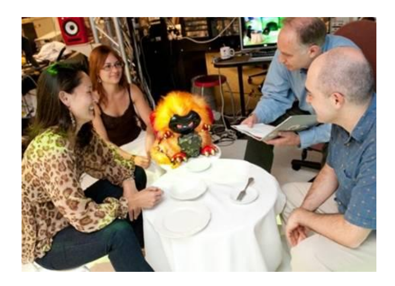
Researchers are spending nearly $1 million to determine if preschoolers can develop language skills by bonding with this dragon robot.