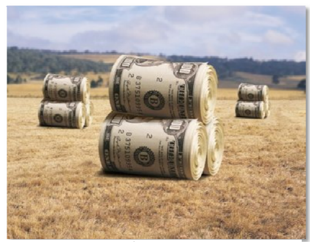
Millionaires received over $316 million in farm program payments from 2003 to 2009.

The 2002 Farm Bill. Congress attempted to limit the number of farm payments that went to wealthy farmers by establishing income limits. Under the Farm Security and Rural Investment Act of 2002 ("2002 Farm Bill") an individual or entity with an AGI of over $2.5 million was ineligible for farm program payments unless at least 75 percent or more of the AGI was farm income. The AGI limitations in the 2002 Farm Bill applied to crops years 2003 through 2008, and applied to most