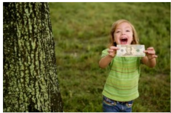
From 2007-09, millionaires deducted over $18 million through the child care tax credit, reducing tax liabilities dollar-for-dollar.

In total, the federal government loaned $16,435,931 to millionaire college students, parents of college students, and graduate students for tuition and related costs in the past four years.<sup>79</sup>