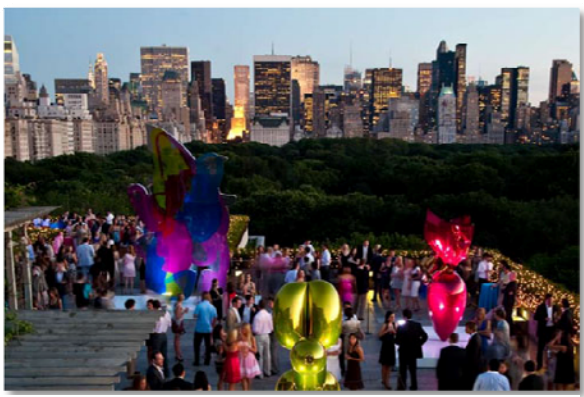
From 2006-09, millionaires deducted over $607 million in business entertainment expenses.

Entertainment includes any activity generally considered to provide entertainment, amusement, or recreation. Examples include entertaining guests at nightclubs; at social, athletic, and sporting clubs; at theaters; at sporting events; on yachts; or on hunting, fishing, vacation and similar trips. <sup>110</sup>