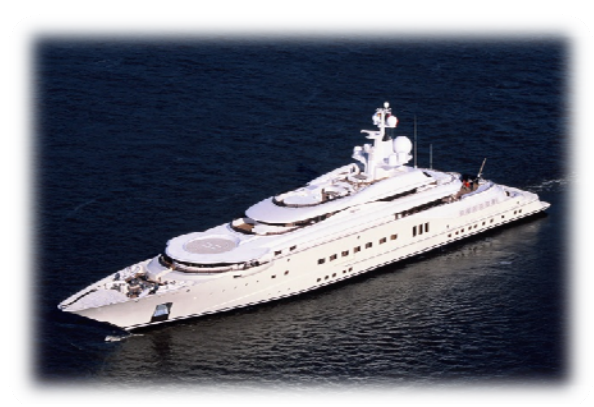
Under the current tax code, a yacht is considered a second residence, allowing an owner to deduct mortgage interest.

considered a second residence, as long as the luxury boat has a sleeping, cooking, and toilet facility and an individual lives in it for at least two weeks a year. 88