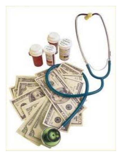
In June 2011, 60,000 millionaires were enrolled in Medicare Part B.

Medicare is one of the largest federal programs, providing health care services for virtually all individuals over the age of 65 and disabled individuals of all ages. When Medicare was proposed, President John F. Kennedy made clear that the purpose of the program was a safety net to cover people "who have saved and worked and then get hit" with a medical problem that costs that person their life savings. <sup>17</sup> Since its creation, however, Medicare's coverage has expanded. In 2011, Medicare will cover an estimated 48 million individuals (40 million aged and 8 million disabled). The Congressional Budget Office estimates that total Medicare spending for 2011 will be about $569 billion, making up 3.7 percent of the gross domestic product.