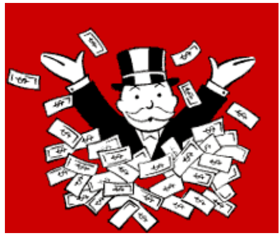
Millionaires received over $9 billion in Social Security Retirement benefits from 2006-09.

The Social Security retirement program is the federal government's largest program, in part because it provides benefits to every American, regardless of need. Social Security is financed by payroll taxes paid by covered workers and their employers. The program was originally intended to be self-funded, but now receives general revenues to provide benefits to retired and disabled workers and certain family members.