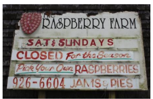
USDA prevented Raspberry Farm in New Hampshire from development by paying a millionaire $630,000.

Wildlife Habitat Incentive Program ("WHIP"). USDA seeks to protect land for certain wildlife through WHIP by providing up to 75 percent cost-share assistance to improve habitats for fish and wildlife. Over the past two years, WHIP doled out $737,000 to three millionaire recipients, with the majority of the funds ($449,662) going to protect the Sage Grouse by a family trust in California. A farm in Georgia also received $100,000 through WHIP for "promotion of at-risk species habitat conservation." The remaining $187,540 went to a company in New Jersey.