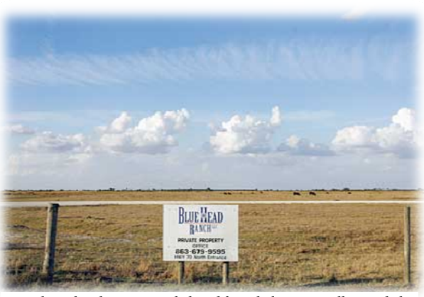
A ranch in Florida was recently listed for sale for $18.2 million and also received $31 million to protect land along Fisheating Creek.

In 2010, through the WRP, the government waived the program limit and paid eight individuals with an AGI of $1 million over $74 million. These included almost $22 million to a ranch in Florida. 46 The company that owns the ranch describes itself as a "privately held, family-owned company with agricultural, commercial real estate, and asset management operations."<sup>47</sup> That company also states that it owns a number of commercial real estate properties in New Jersey and Florida. The company also claims holdings that include multi-tenant office buildings, parking lots, a for-profit educational institution, restaurants, and retail property.<sup>48</sup>