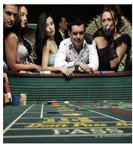
Millionaries deducted over $20 billion in gambling losses from 2006-09.

Under the current tax code, casual gamblers (as opposed to those gambling as a business) are required to report gambling winnings, which are fully taxable. This includes winnings from lotteries, raffles, horse races, and casinos. Gambling winnings also includes any cash winnings and