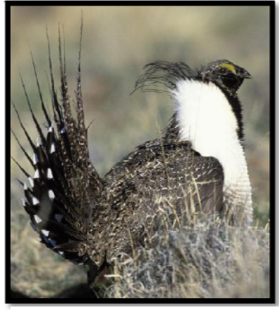
USDA paid millionaires $749,509 to protect the Sage Grouse.

Environmental Quality Incentive Program ("EQIP"). Through EQIP, USDA provides financial assistance for landowners to improve soil, water, plant, animal, air and related resources on farm lands. To date, USDA has