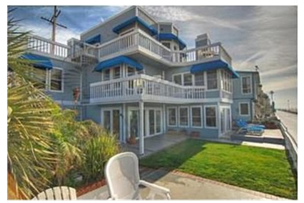
The beach house featured in the original Beverly Hills 90210 series was recently listed for sale for close to $9 million. As a second home, it could qualify for the home mortgage interest deduction.

A homeowner can deduct the interest paid on a mortgage covering a primary or secondary home, which, in turn, reduces that taxpayer's income tax. Limits on the deduction do exist, though. Under current law, homeowners can deduct the interest paid on home mortgages for primary residences and vacation home loans up to $1 million. Current law also allows homeowners to deduct mortgage interest on an additional $100,000 home equity line of credit. The amount of an individual's mortgage interest deduction generally increases as that individual's income increase. This is due to the fact that paying a higher marginal tax rate results in greater savings when mortgage interest is deducted and individuals with higher income generally purchase more expensive homes, which require a larger mortgage.