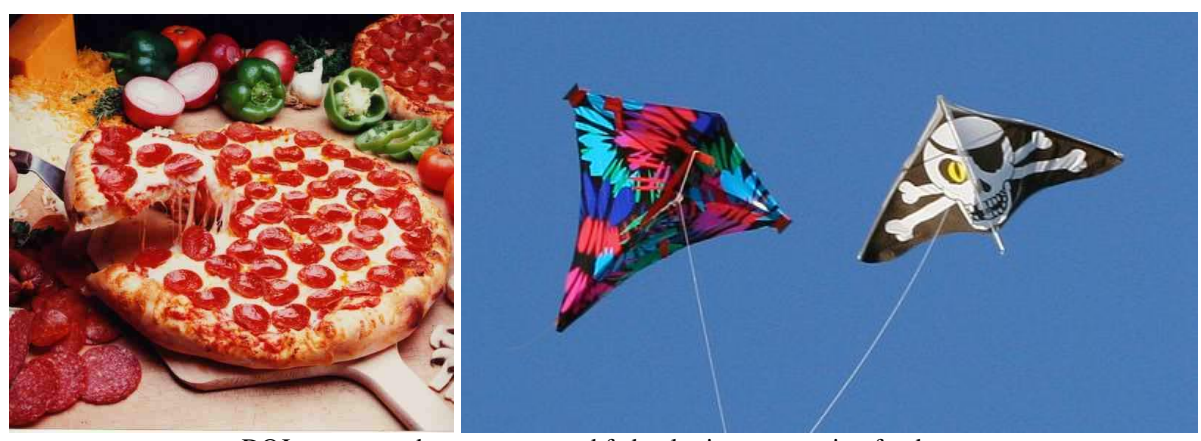
DOJ recommends grantees spend federal crime prevention funds on activities like trips to pizza restaurants and kite flying.

What we do know is that DOJ actively encourages grantees to spend federal crime prevention funds on parties and other fun activities, but is not tracking how much is being spent on these activities or if they are having any impact whatsoever preventing crime. This report looks at some of the questionable activities DOJ is supporting with taxpayers' money.