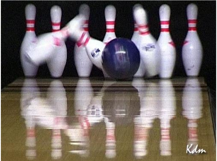
Are roller coaster rides at Six Flags and bowling keeping kids in Milwaukee safe from crime?