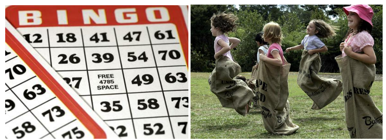
BINGO and sack races were the featured activities at the Fun Day in East Chattanooga, Tennessee, sponsored by a DOJ program.

Chattanooga, Tennessee. The St. Petersburg, Florida, Weed and Seed also sponsored a number of "Fun Days" with free food, raffles, and entertainment. 52