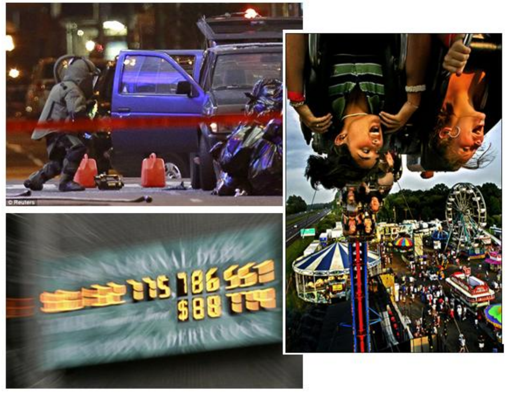
As the nation faces the threats of domestic terrorism and a $13 trillion national debt, the U.S. Department of Justice spends taxpayer funds on parties, roller coaster rides and all kinds of fun!