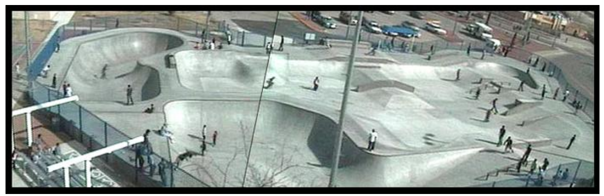
This skatepark in El Paso, Texas, was paid for with a $625,000 grant from HUD's Community Development Block Grant program. 149

From Texas<sup>142</sup> to West Virginia,<sup>143</sup> the U.S. Census has hosted block parties across the country this year. Thousands of dollars of Department of Education funds have been spent on party favors and give aways.<sup>144</sup> Funds from a Department of Labor job training grants paid for hotel parties in Ohio<sup>145</sup> and Florida.<sup>146</sup> Federal stimulus funds have paid for a garden party in Ohio<sup>147</sup> and thousands of dollars worth of party supplies in Baltimore, Maryland.<sup>148</sup>