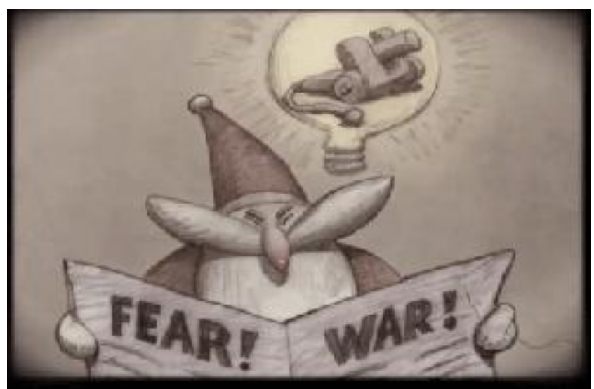
"Santa, the Fascist Years" is one of the recent features at an annual film festival put on by the Woodstock Film Festival which received a $30,000 DOJ congressional earmark to support at risk youth.

Woodstock Film Festival Inc. (WFF) received a $30,000 congressional earmark in the FY 2010 appropriations conference report for a "youth at risk" initiative. The organization presents "a year-round schedule of film, music, and art-related activities," also holds an annual film festival, and its Youth Initiative includes screenings, seminars, and workshops. The 2009 film festival featured "Santa, the Fascist Years" which "uncovers and explores Santa's flirtation with politics and greed," according to the group's website. "9"