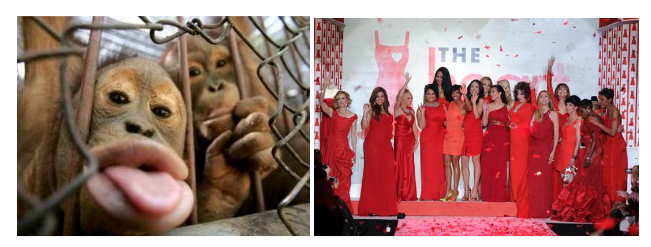
The federal government has sponsored zoo trips and fashion shows with funds to prevent both crime and HIV/AIDS.

DOJ's Weed and Seed program has sponsored zoo trips as a type of crime prevention, <sup>152</sup> while the Centers for Disease Control and Prevention has also sponsored zoo trips as a form of HIV/AIDS prevention. <sup>153</sup> Neither department could provide evidence to demonstrate the zoo trips had either outcome.