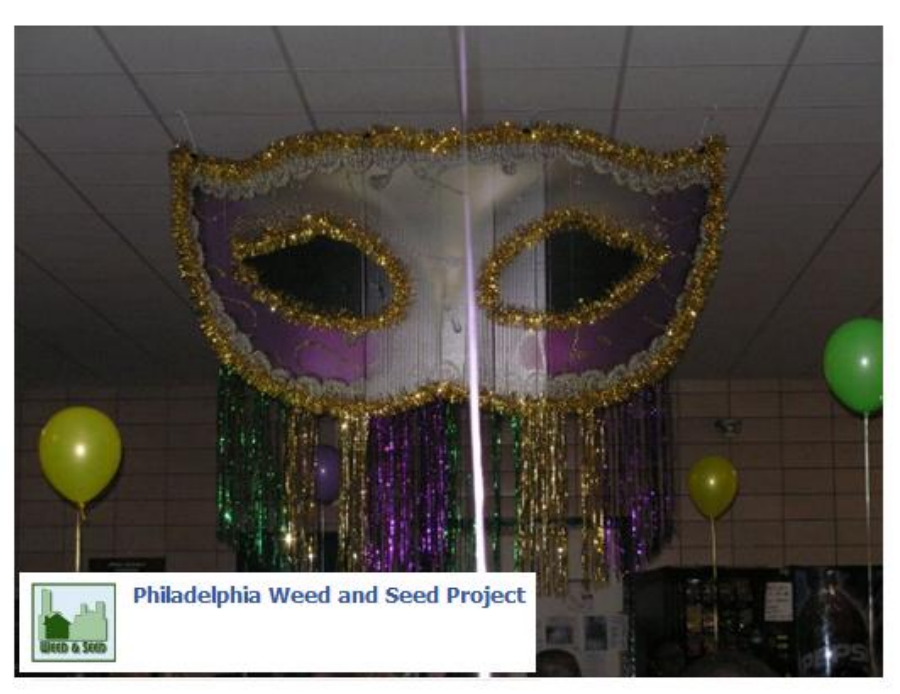
Philadelphia Weed and Seed Project's "Mardi Gras" themed Christmas Party. 31

In December 2009, the Philadelphia Weed and Seed Project held a "Mardi Gras" themed Christmas Party,<sup>29</sup> and the Weed and Seed program in Fairbanks, Alaska, holds an annual luau and pool party in January.<sup>30</sup>