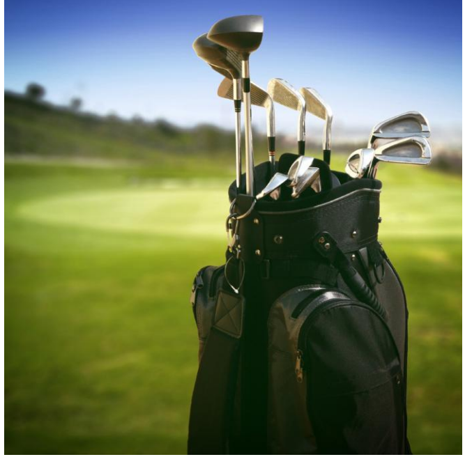
Golf outings are popular DOJ activities, as crime prevention programs for children and as well as escapes for department officials attending conferences.