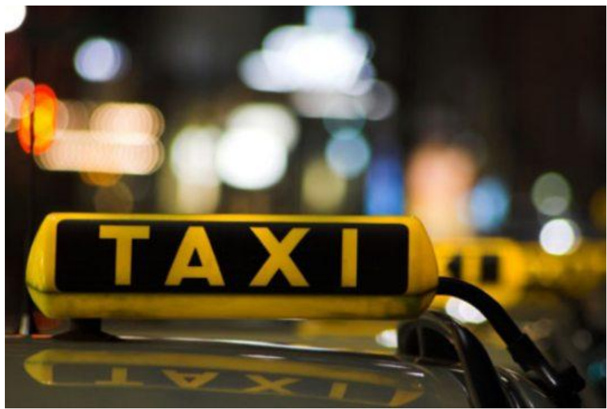
Medicaid is improperly spending millions of dollars every year for cab rides. A New York woman, for example, took a $300 taxi ride to visit her son every day for three years

This proposal would eliminate such blatant waste of scare federal resources by strengthening program integrity provisions and making changes to the payment of transportation.