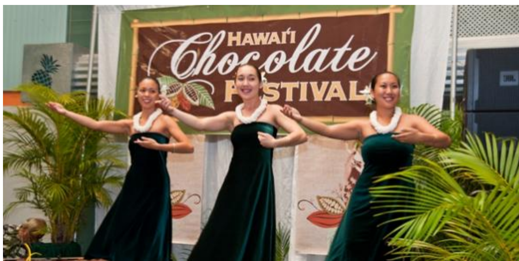
The Hawaii Chocolate Association received SCBGP funds to support the annual Hawai'i Chocolate Festival the past two years.