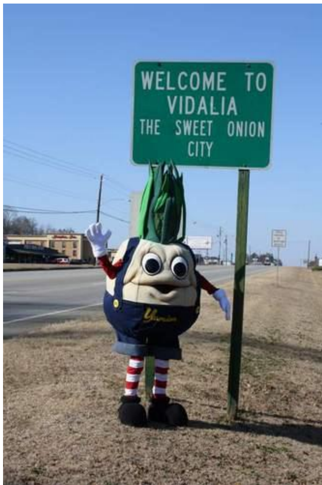
The Specialty Crop Grant Block Grant Program has funded the Vidalia Onion Museum as well as a Vidalia Onion Jingle Contest.