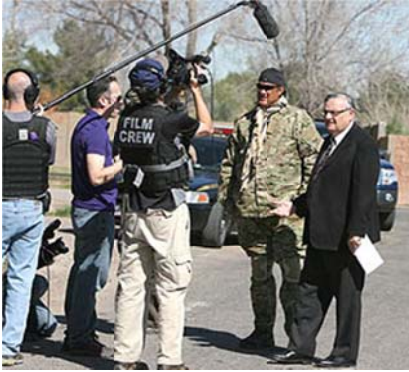
Left: Steven Seagal and Maricopa County Sheriff Joe Arapio

A review of Arizona's UASI grant awards shows that several police departments and the Maricopa County Sheriff's Office used UASI grants to purchase armored vehicles. 201 In 2011, the Maricopa County Sheriff's Office used two armored vehicles and a SWAT team to conduct a raid of the residence of a man suspected to be involved in cockfighting. The actor Steven Seagal, who was then filming his television show 'Lawman,' participated in the raid and rode in one of the armored vehicles. 202