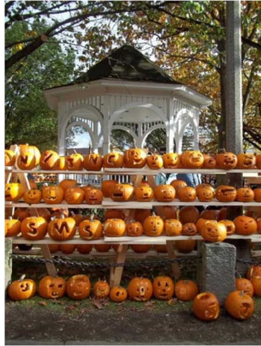
Keene Pumpkin Festival, potential terrorist threat?