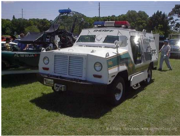
Peacekeeper vehicle owned by Pinellas County Sheriff's Office in Florida

Seizing on the opportunity, some vendors now