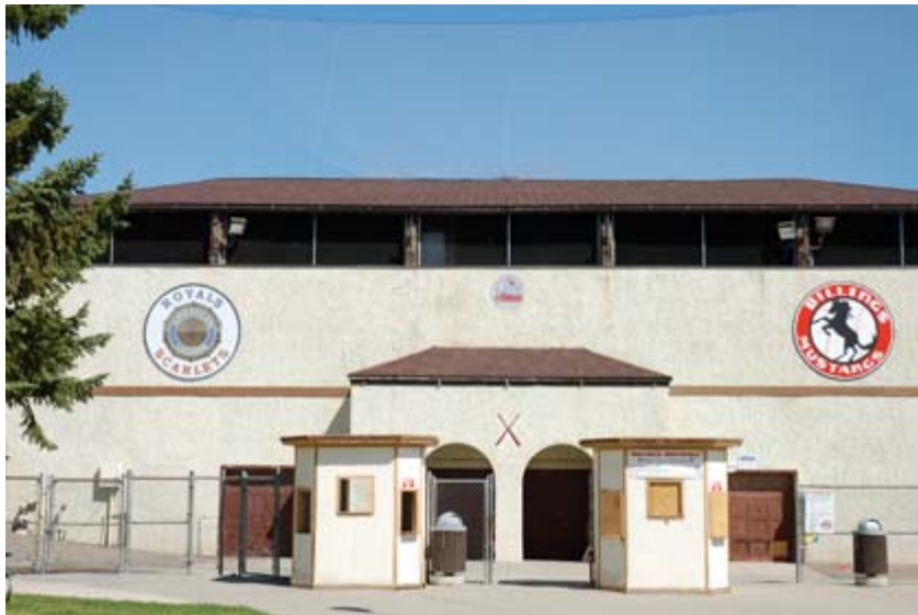
Existing Cobb Field

On November 7th Billings's residents approved a $12.5 million bond issue to build a new minor league baseball stadium at Athletic Park. Shortly after the passage of the bond issue City Council directed the design team of HNTB Montana, Inc. to move ahead with the project.