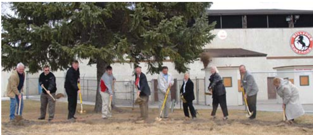
CITY COUNCIL BREAKS GROUND FOR NEW STADIUM 3/21/2007

Billings' new ballpark will meet the National Collegiate Athletic Association and the National Association of Professional Baseball Leagues' standards for Collegiate and Minor League baseball. The facility will also be able to accommodate a wide variety of community programs including craft fairs, and other similar community events.