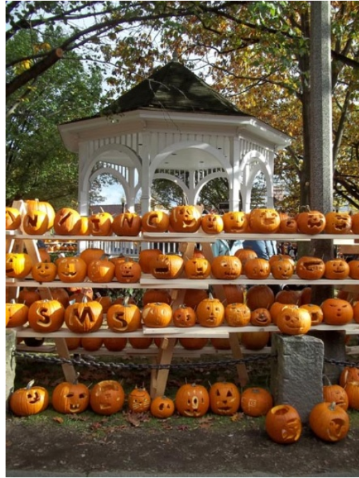
Keene Pumpkin Festival, potential terrorist threat?

The grant application for the BearCat cited the 2004 Pumpkin Festival and the 2007 Red Sox Riots, when the Red Sox won the World Series as examples of incidents when the BearCat could be used. 197 The Pumpkin Festival is an annual event with 70,000 visitors, many who come to Keene in hopes of breaking the world record of lighting the most Jack’o’Lanterns. The current world record holder is Boston with 30,128 lit pumpkins. 198 Local law enforcement considers the festival a possible target for terrorists. “Do I think al-Qaeda is going to target Pumpkin Fest? No, but are there fringe groups that want to make a statement? Yes,” said Kenneth Meola, Keene Police Chief. 199