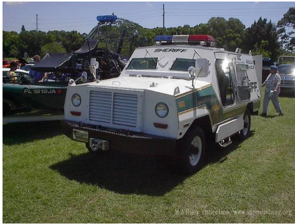
Peacekeeper vehicle owned by Pinellas County Sheriff's Office in Florida

Seizing on the opportunity, some vendors now