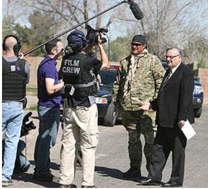
Left: Steven Seagal and Maricopa County Sheriff Joe Arapio

A review of Arizona’s UASI grant awards shows that several police departments and the Maricopa County Sheriff’s Office used UASI grants to purchase armored vehicles. 201 In 2011, the Maricopa County Sheriff’s Office used two armored vehicles and a SWAT team to conduct a raid of the residence of a man suspected to be involved in cockfighting. The actor Steven Seagal, who was then filming his television show ‘Lawman,’ participated in the raid and rode in one of the armored vehicles. 202